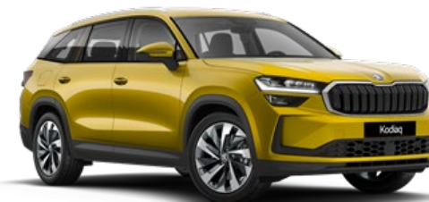
Bronx Gold (- Metallic)