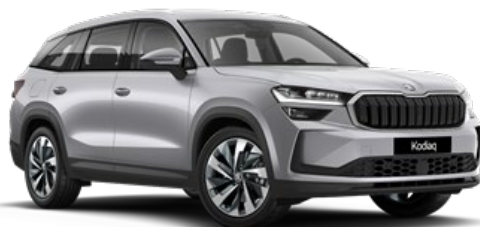
Brilliant Silver (8E8E - Metallic)