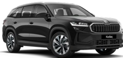
Black Magic (1Z1Z - Metallic)