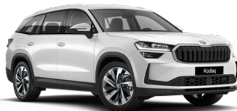
Moon White (2Y2Y - Metallic)