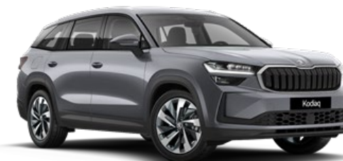
Graphite Grey (5X5X - Metallic)