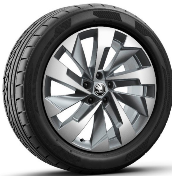
19" 'Halti' anthracite alloy wheels (Code 46W)