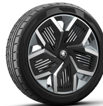
20" 'Rila' aero alloy wheels (Code TBC)