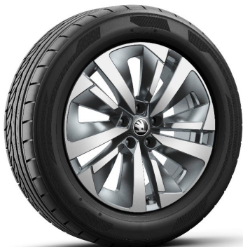
18" 'Soira' anthracite alloy wheels (Code F04)