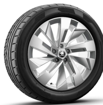
19" 'Talgar' silver alloy wheels (Code PJ4)