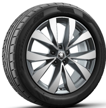
19" 'Lefka' anthracite alloy wheels (Code PJ5)