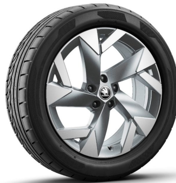
19" 'Tirsuli' anthracite alloy wheels (Code TBC)