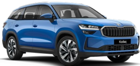
Energy Blue (K4K4 - Solid)