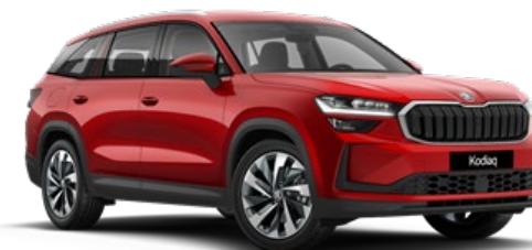
Velvet Red (K1K1 - Exclusive)