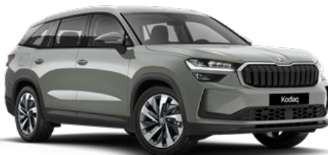
Steel Grey (M3M3 - Solid)